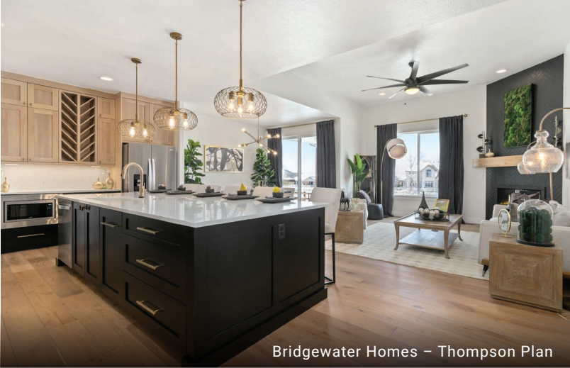
Bridgewater Homes – Thompson Plan