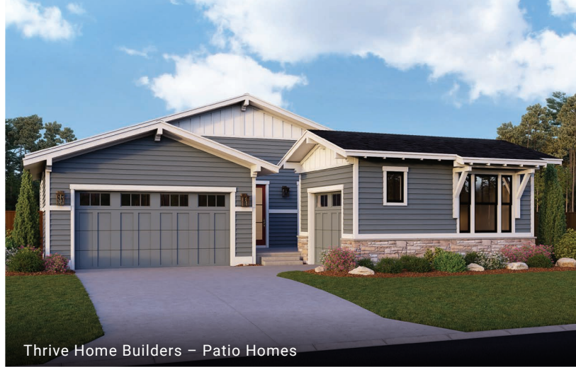
Thrive Home Builders – Patio Homes