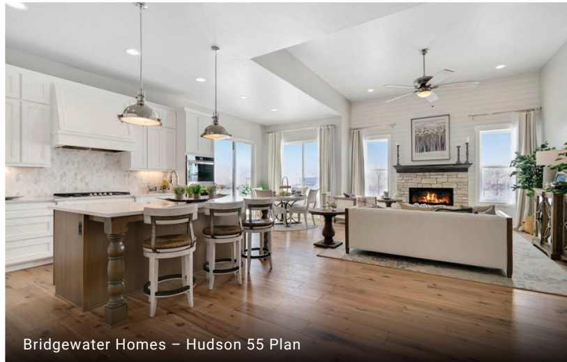
Bridgewater Homes – Hudson 55 Plan