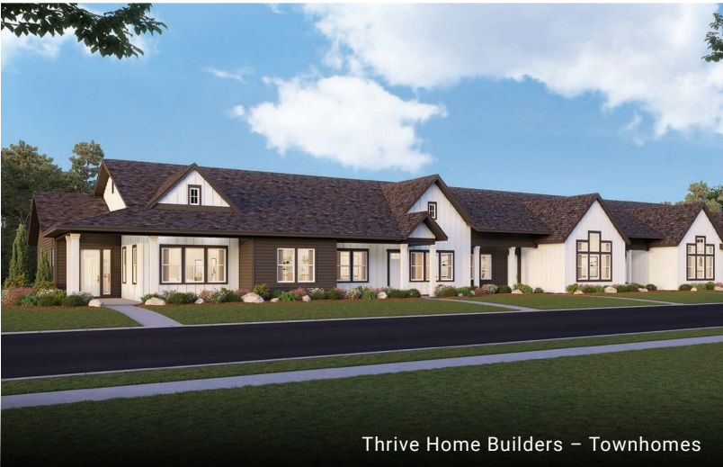
Thrive Home Builders – Townhomes